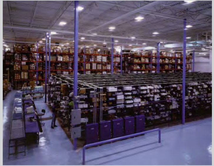
The five horizontal carousels store supplies, while the Aisle-Saver system (in the background) contains bulk items.

TSYS gained 5,000 square feet of floor space.