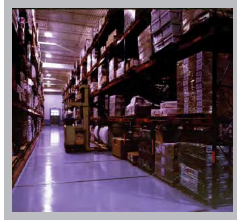
The Aisle-Saver system consists of eight movable carriages - four on each side with an aisle running down the middle.

The Aisle-Saver system consists of eight movable carriages - four on each side with an aisle running down the middle. There are also four fixed carriages - two on each side. The system provides TSYS with storage for 2,256 pallets - a total capacity of almost 4,000 tons of paper items.