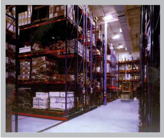
The high-density Aisle-Saver system along with the static pallet racks provides TSYS with 2,256 storage locations for pallets.